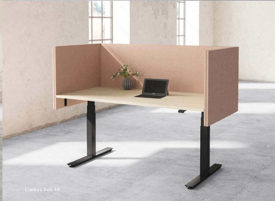
Limbus Sub 40