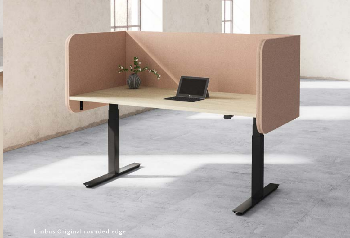
Limbus Original rounded edge