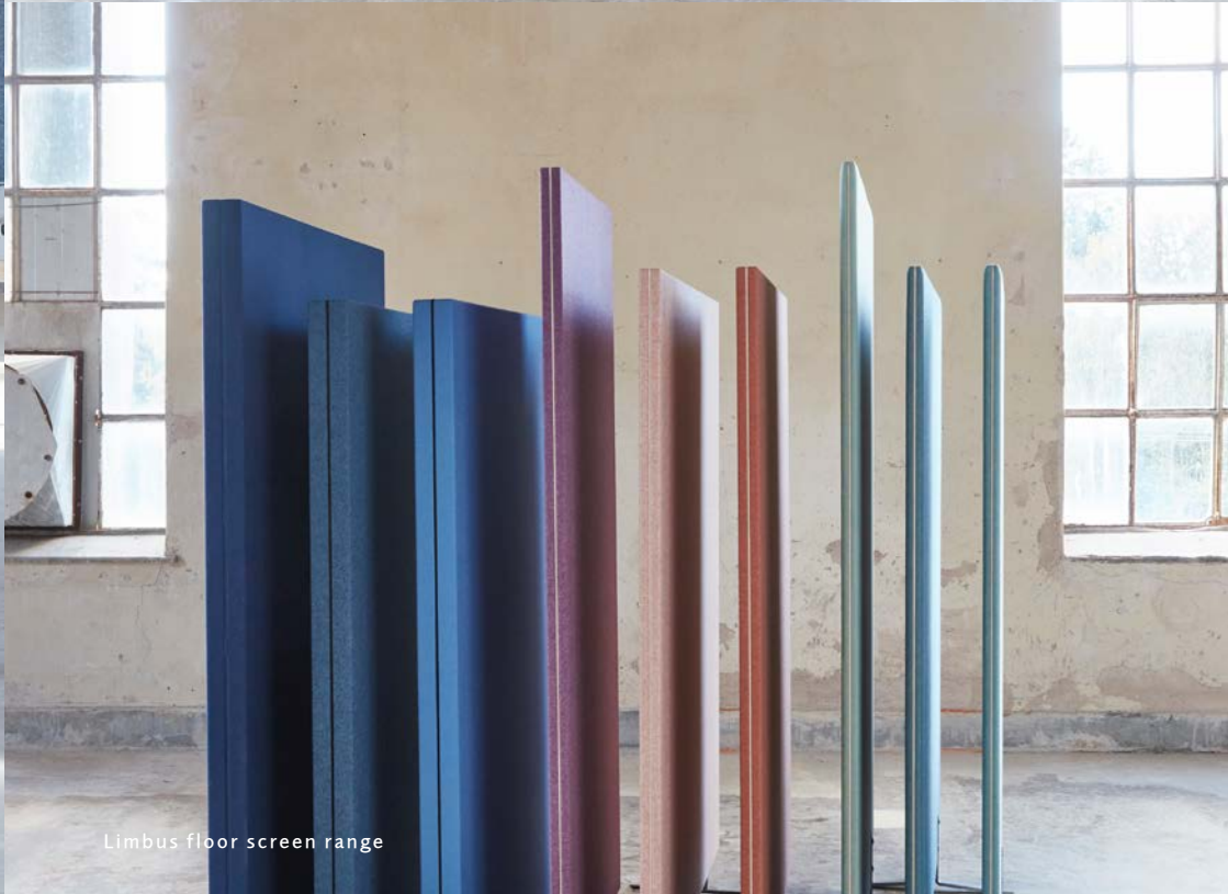
Limbus floor screen range