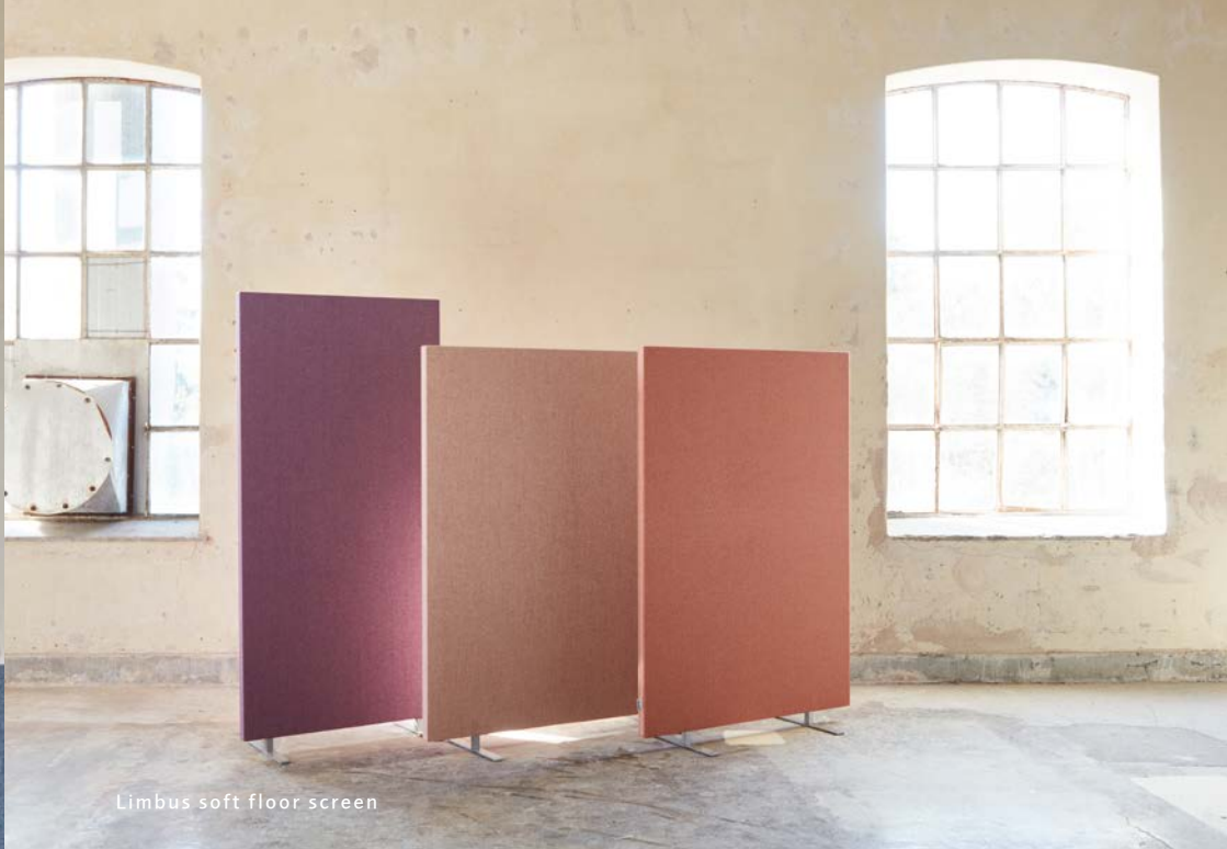
Limbus soft floor screen