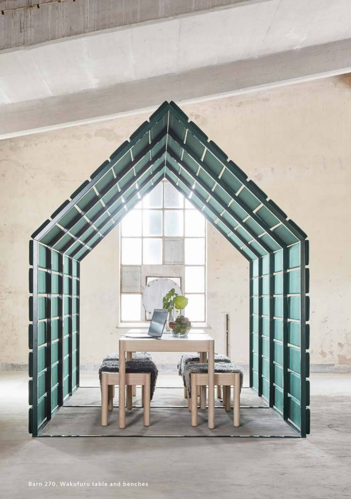
Barn 270, Wakufuru table and benches