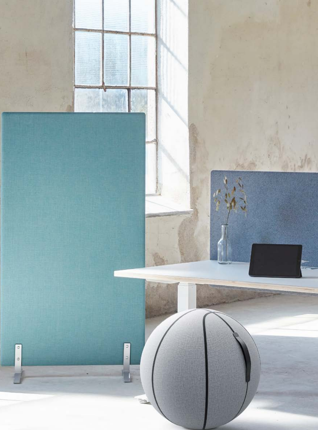
Limbus light floor screen, Limbus light desk screen, Basketball