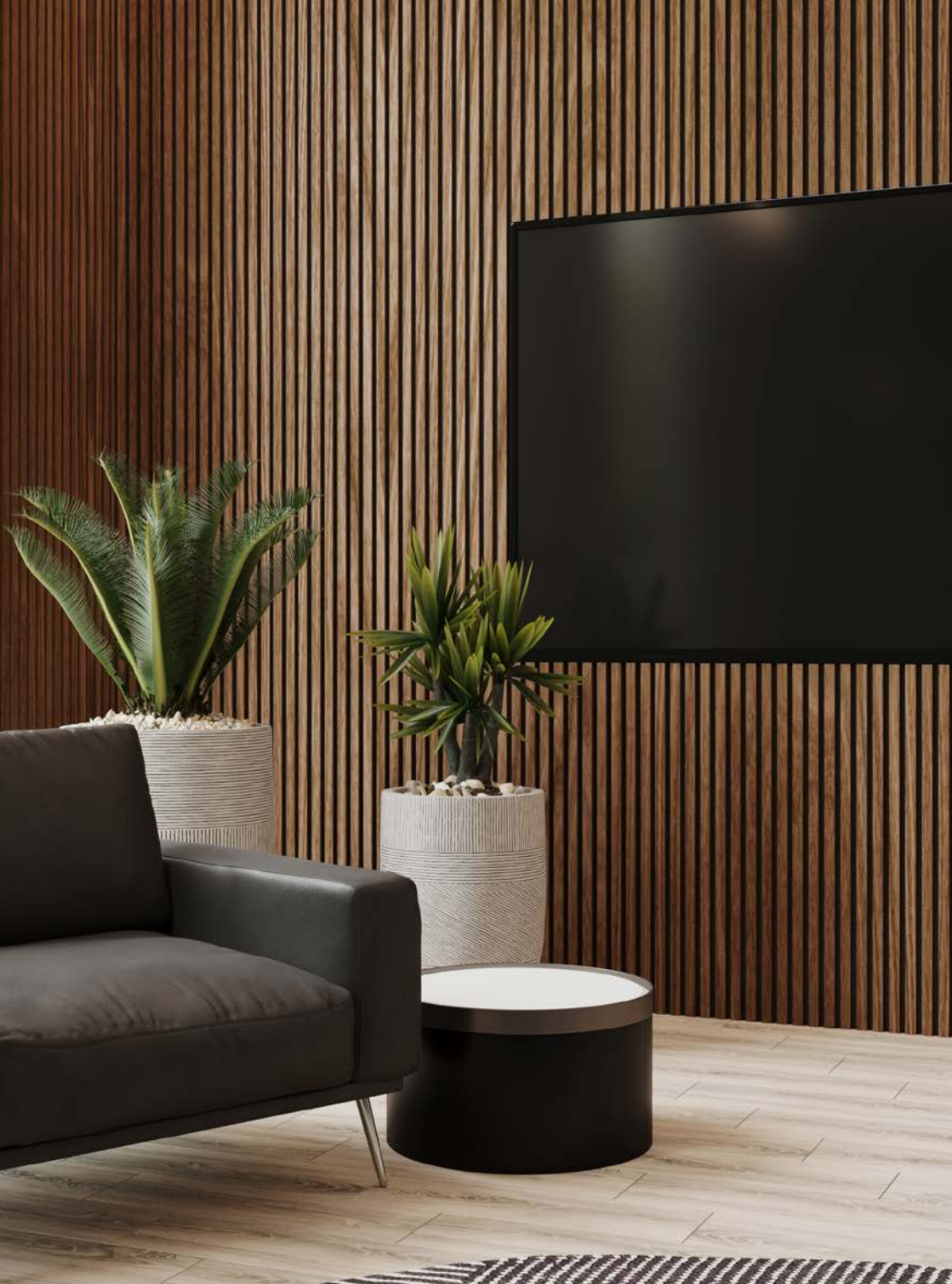
Ribbon wall panels