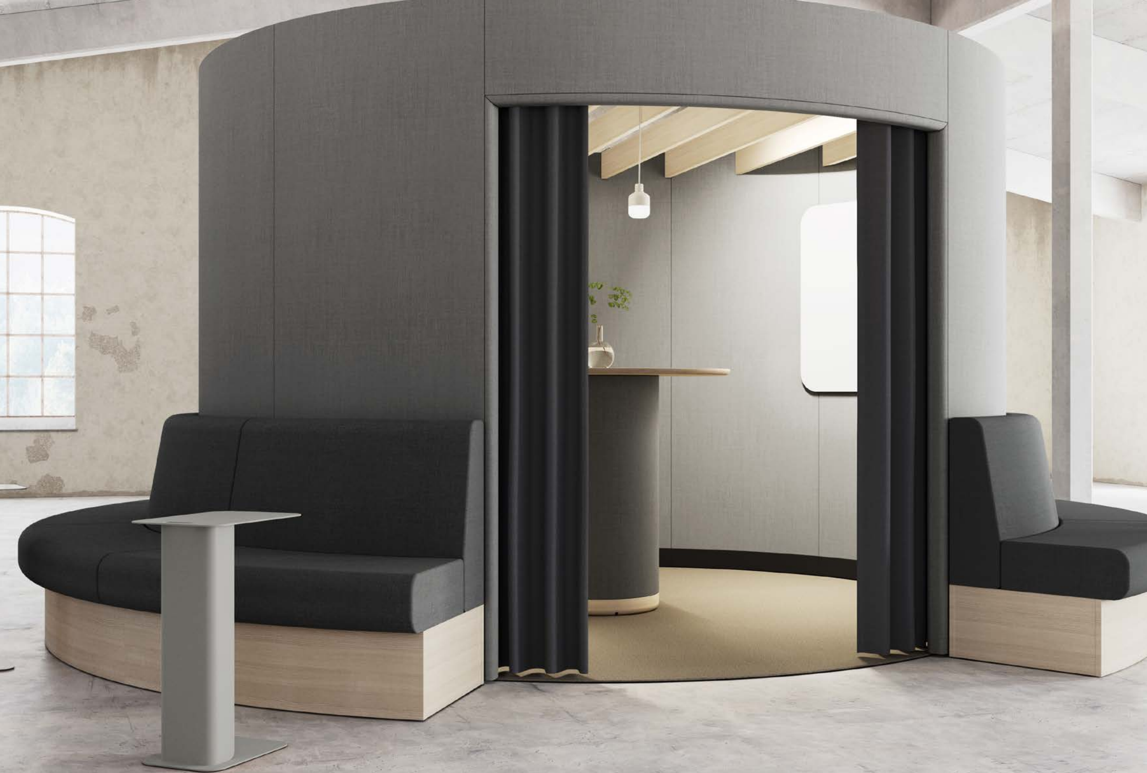
Code laptop table, Open Pod R4 and sofa, Woofer meeting table