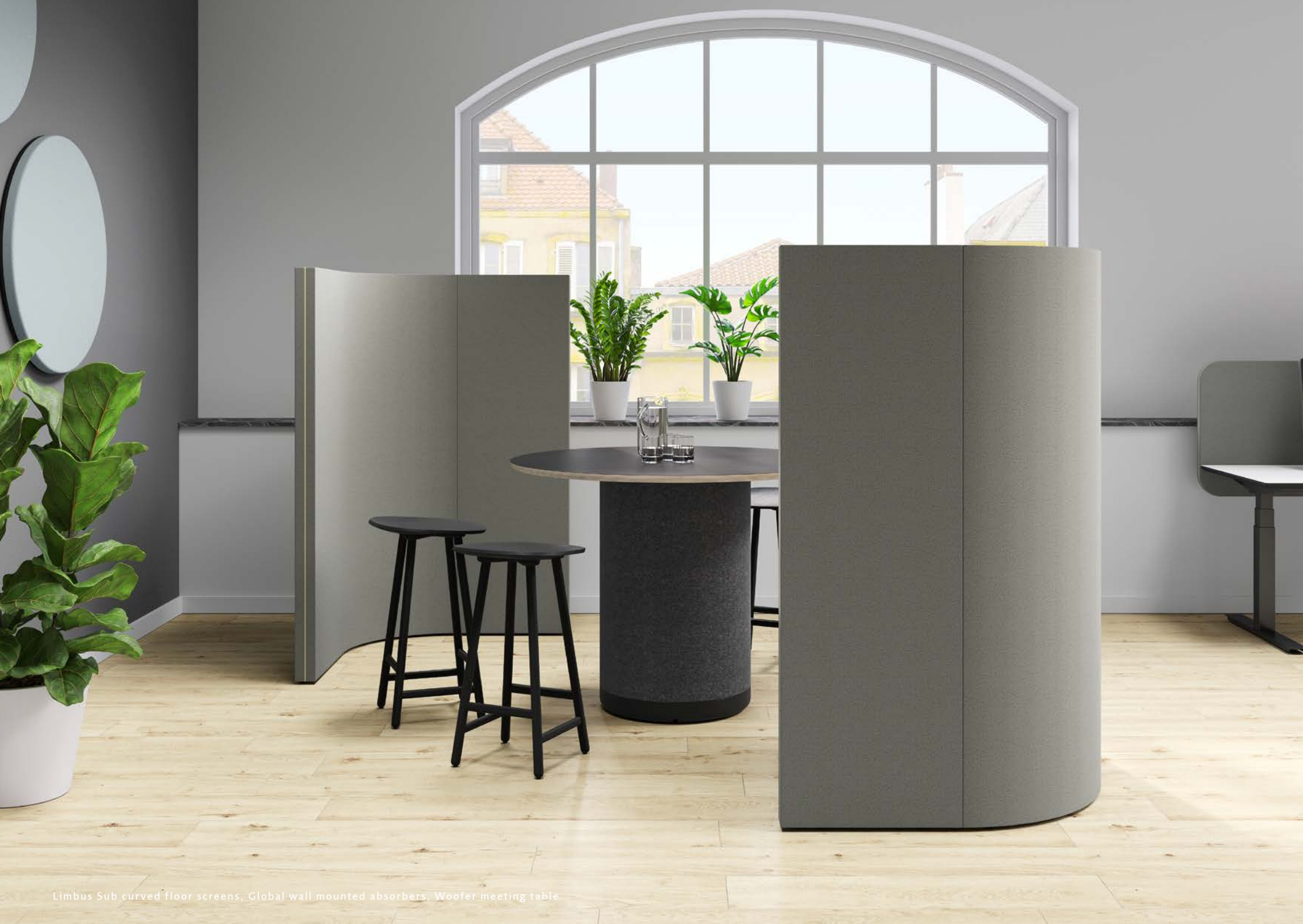
Limbus Sub curved floor screens, Global wall mounted absorbers, Woofer meeting table