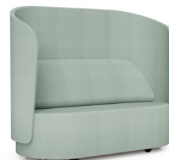
Circles sofa high