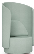
Circles chair high