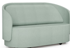
Circles sofa low