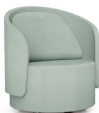
Circles chair low

A series of individual pieces of seating furniture with different heights of back, easy to put together into small meeting groups in open areas. The furniture has castors and is easy to move. Each castor is equipped with a brake. Black wooden legs is available as an option.